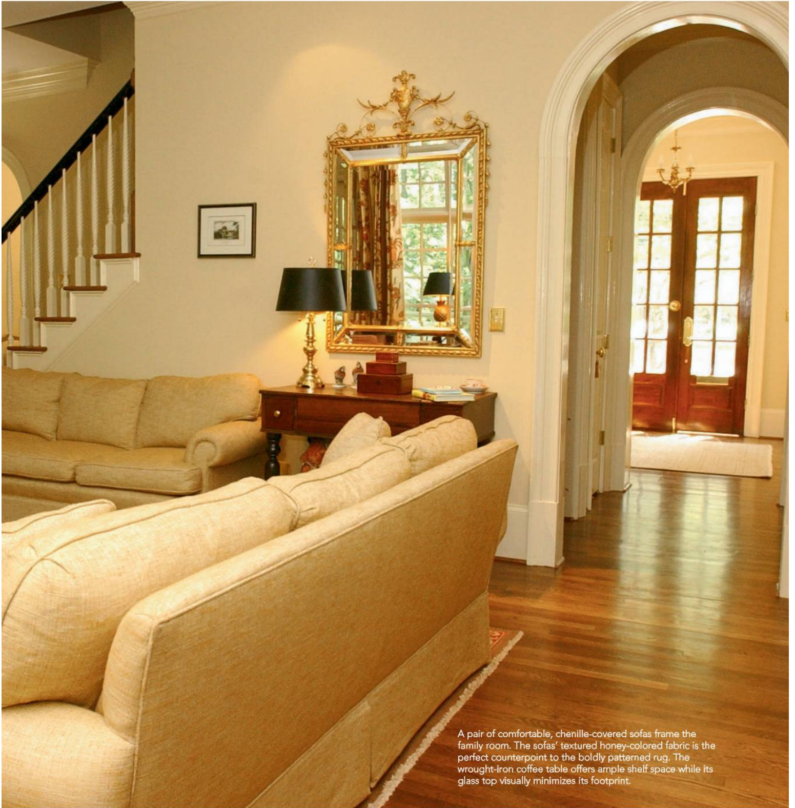
A pair of comfortable, chenille-covered sofas frame the family room. The sofas' textured honey-colored fabric is the perfect counterpoint to the boldly patterned rug. The wrought-iron coffee table offers ample shelf space while its glass top visually minimizes its footprint.